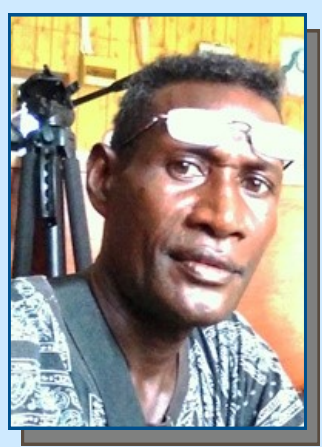
Rellysdom A Malakana Catholic Media Office

The itinerary for Pope Francis's travels to Indonesia, Papua New Guinea, Timor-Leste, and Singapore, which will begin on September 2, 2024, has been made public by the Vatican.